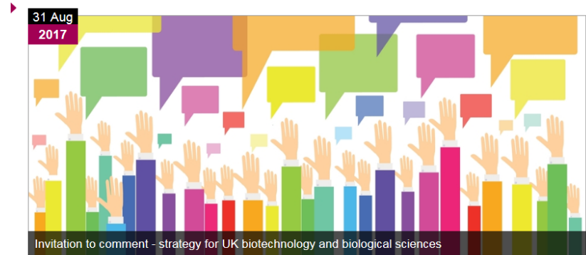
Invitation to comment - strategy for UK biotechnology and biological sciences

BBSRC is inviting comment on the future strategy for UK biotechnology and biological sciences. An online questionnaire seeks input to shape our emerging thinking. The questionnaire is open to all, see: Key Survey: Strategy for UK biotechnology and biological sciences (read our Terms of use: Key Survey ), it closes on 11 October 2017.